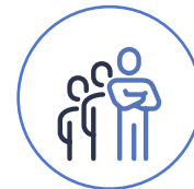
Human Resource Management