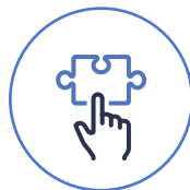
Organizational and Management Development