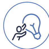
Marketing & Business Development Management