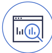
Business Planning and Control